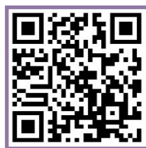
JW Life Science